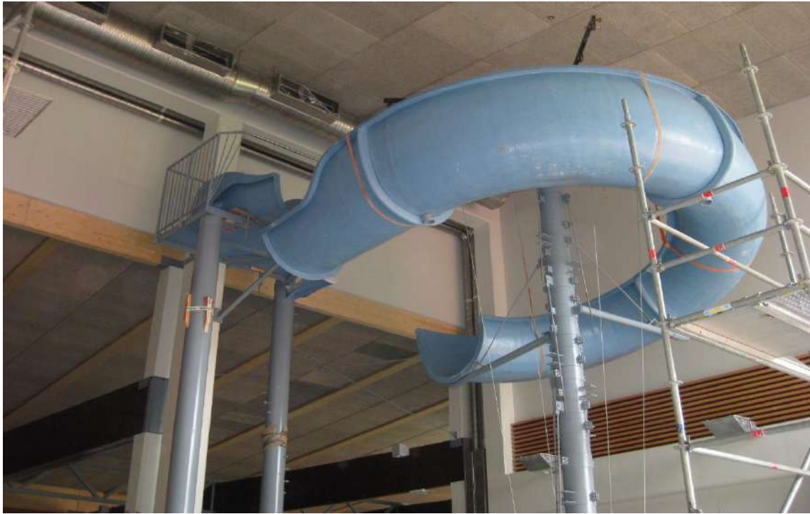
Picture: Water slide installation, Keuruu public swimming pool

The water slide and its structures are supported by the central pillars of the curves and the pillars below the trough. The steel support structures are hot dip galvanized epoxy painted steel. The color of the supporting structures can be selected according to the RAL Classic color chart.