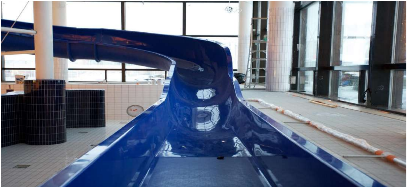
Picture: Vuosaari public swimming pool

Blue Water is a water slide model developed by Pointman Oy. Its geometry allows us to customize the product better according to customer requirements.