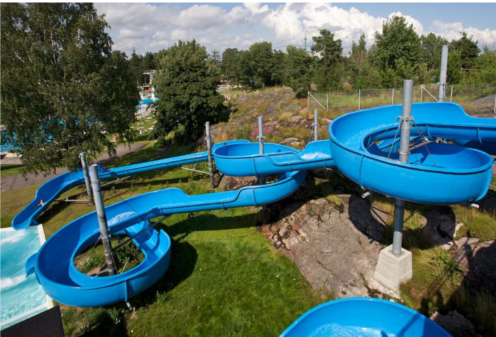
Picture: Helsinki swimming stadium

Address Niinistökatu 14 05800 HYVINKÄÄ FINLAND