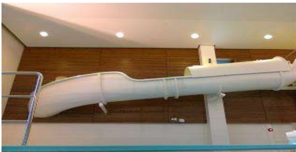
Picture: Pori public swimming pool

The versatility of collection allows the installation of water slide both indoors and outdoors. The color of the slide is also adjustable. We use colors from the RAL Classic color chart.