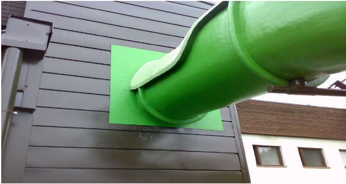
Picture: Water slide that runs both indoors and outdoors, Hotel Kuntoranta, Varkaus

We also provide the accessories you need for the package, such as: