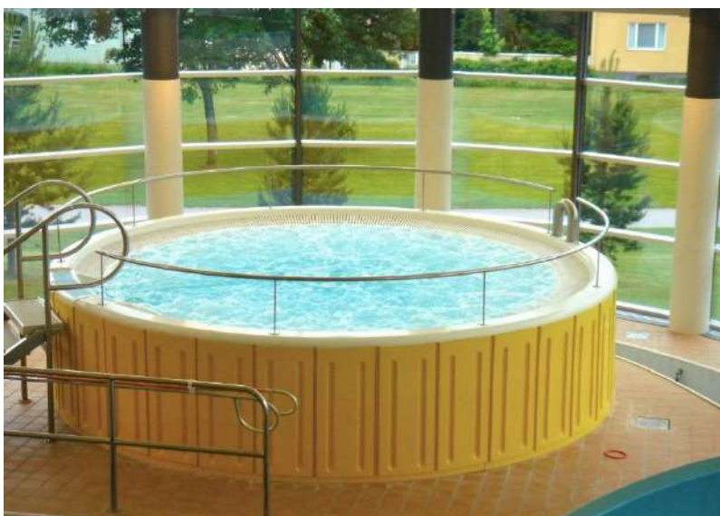
Picture: Porvoo indoor swimming hall